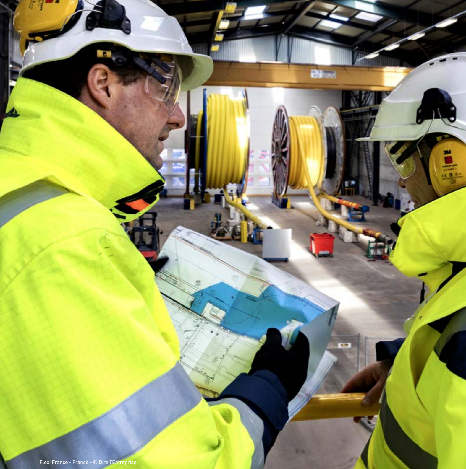
Flexi France - France