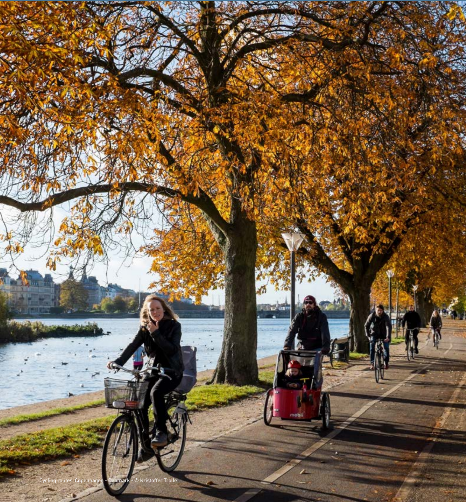
Cycling routes, Copenhagen - Denmark

Artelia is an independent group operating in a wide range of services (project management, engineering, consulting and audits and turnkey services) in a very diversified field of activities: building construction, water, energy, environment, industry, maritime, transport, urban development and multi-site programs.