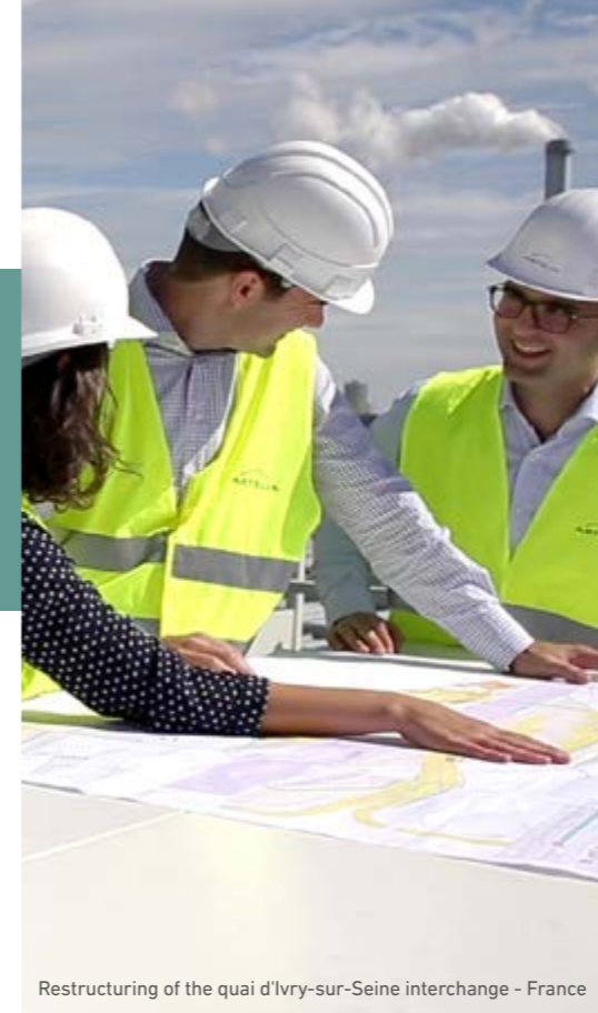
Restructuring of the quai d'Ivry-sur-Seine interchange - France

Patronage actions must be booked in the accounts of the Group company concerned and be reported to the Group and business unit ethics and integrity officers.