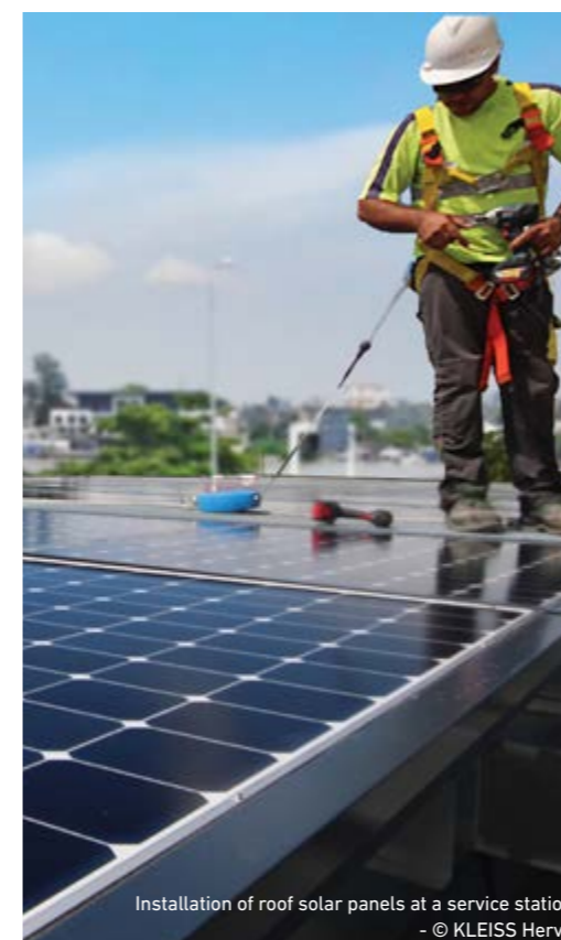
Installation of roof solar panels at a service station

So-called "facilitation" payments are unofficial payments, usually made to facilitate administrative formalities. These payments, which may be tolerated in some countries where such practice applies, are deemed corruption. Artelia has therefore made the courageous and determined decision to prohibit such payments.